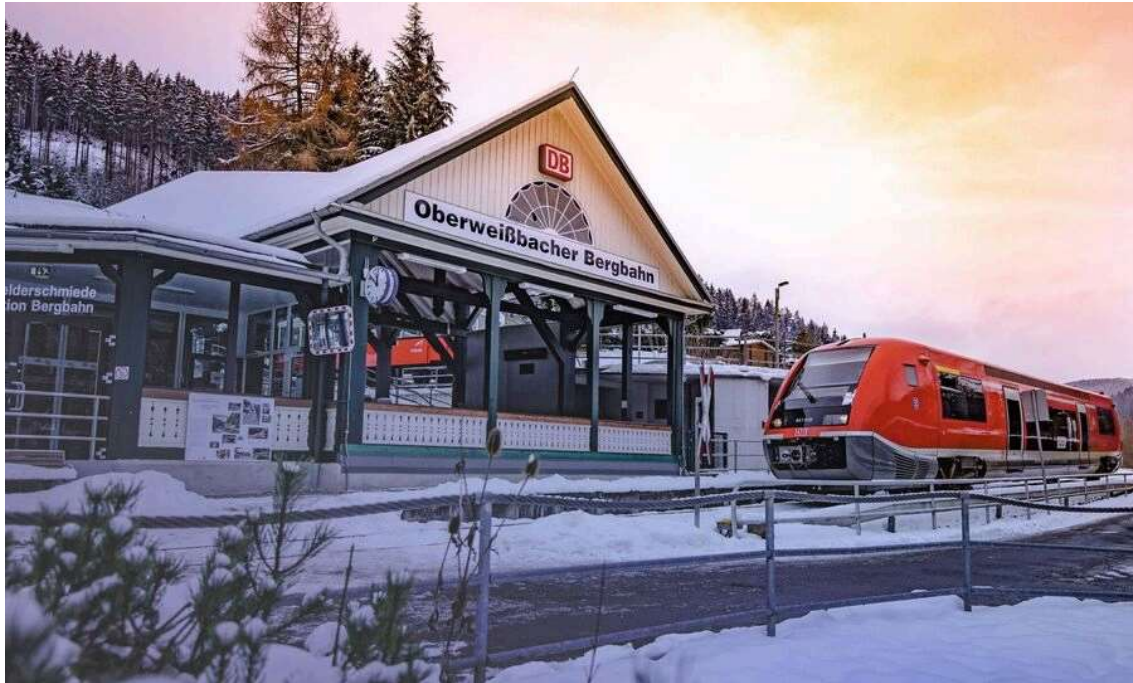
Thuringian Mountain Railway valley station – Oberweißbach