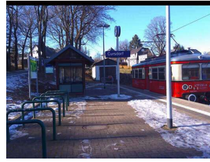
Flat section "mountain railway"